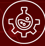
Laboratory Approval Tests